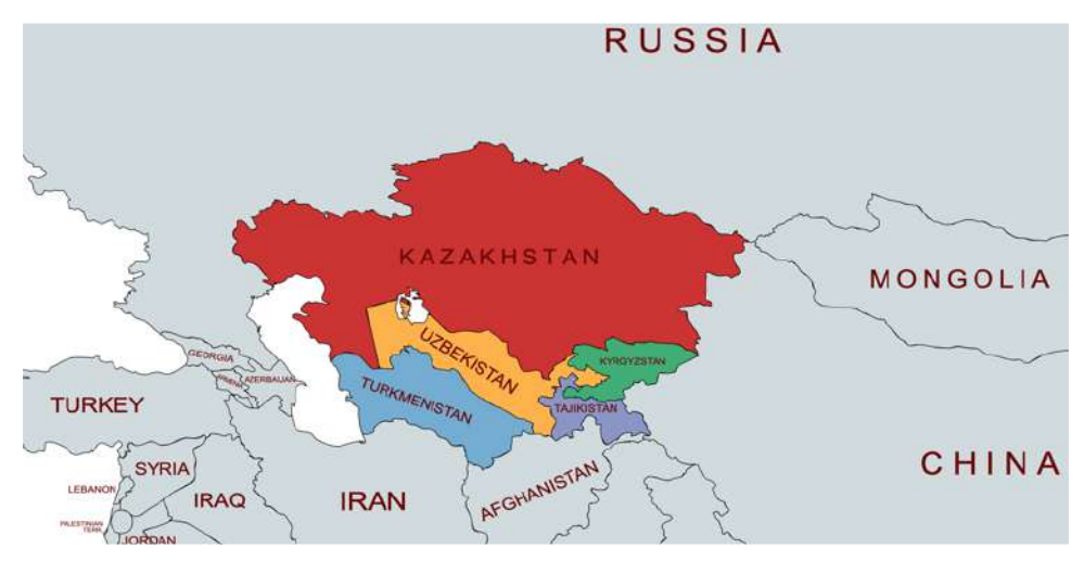
Figure 2. Map of Central Asian countries involved in the Regional Hub

Central Asia is a region in Asia that stretches from the Caspian Sea in the west to China and Mongolia in the east, and from Afghanistan and Iran in the south to Russia in the north, including the former Soviet republics of Kazakhstan, Kyrgyzstan, Tajikistan, Turkmenistan, and Uzbekistan (Figure 2). It is a diverse region with a mix of upper middle- and low-income countries with major strategic importance due to their geographic location and natural resource endowments.